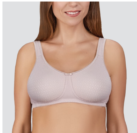
WITH BALANCE ADAPT AIR